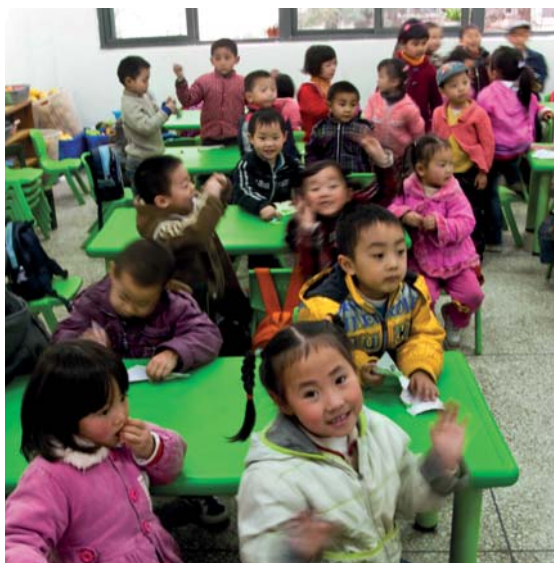
Children in Jinyan School are happy about their new laboratory building

Generally the labor resources of the Chinese market reflect a shortage, especially of blue collar workers. For the specific requirements of our industry, qualified professionals are sometimes also difficult to find. So campus recruiting, people & organization development (i.e. succession planning, process improvement) have become major topics when it comes to supporting our business growth.