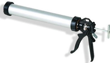
Avon Manual Gun - for 300 & 400 ml ssgs