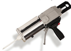
DMA 200-10 Manual Gun - for 250 ml, 2-part ctgs