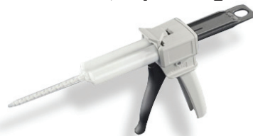
DMA 51-00-10 Manual Gun - for 50 ml, 2-part ctgs