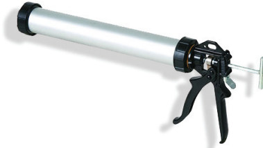
Avon 15" Manual Gun - for 300 & 600 ml ssgs