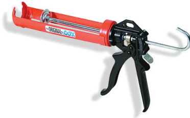
Chilton Manual Gun - for 300 ml ctgs