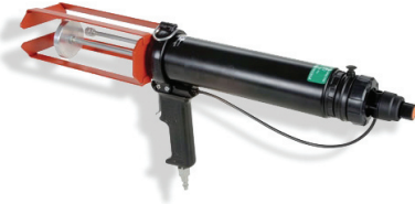
Cox Pneumatic Gun - for 490 ml ctgs