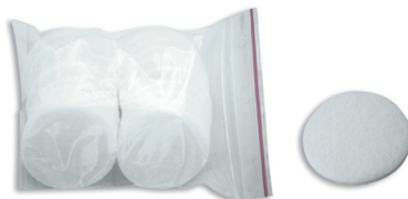
Felts for Adaptors