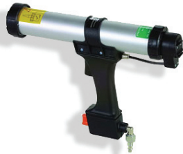
Trent Pneumatic Gun - for 400 ml ssgs