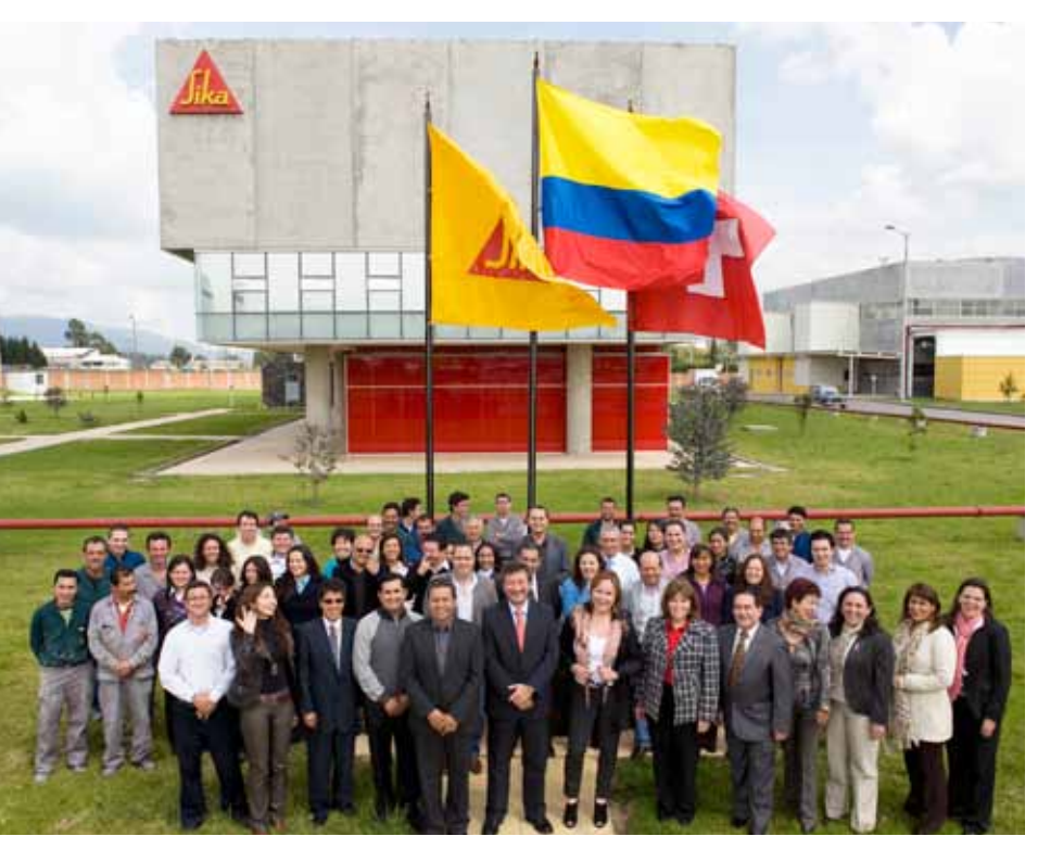
Proud employees of Sika Colombia

In order to complete the value chain, the waste is also recycled for compost production to generate humus, which is used for gardens and by tree nurseries in the neighborhoods. There is only one waste material from industrial water that is disposed of as debris. Environmental care and sustainability of industrial activity diminishes the impact on natural resources, is cost effective and improves environmental responsibility. The target of the second phase of this water program is to have zero waste. Sika is now sending a request to the local environmental authorities for a license for further development.