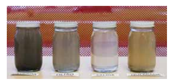
The third glass shows the final result of the purification process.

biological and chemical processes, it is recovered in compliance with environmental guidelines so it can be discharged back into a river.