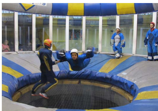
Weightless and windy: bodyflying

of waterproofing systems, admixtures, equipment for shotcrete (Aliva), Sika’s microstructure technology lab and the VSH lab (where companies run their own tests on a large scale). We were really impressed by the Sika microstructure lab. There, they are always analyzing new things and improving their own products. In this lab, we could see some impressive high-tech equipment at work – including x-ray diffraction and an electron microscope. In the VSH Lab we learned more about shotcrete and even had a chance to spray it ourselves! Besides the technical learning experience, we also enjoyed some sightseeing and took part in exciting sports – such as body flying, where you can fly above a huge ventilator! Finally we would like to thank the whole Sika staff: you were very hospitable, and helped to make this trip an unforgettable one!”