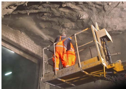
Students spraying shotcrete themselves