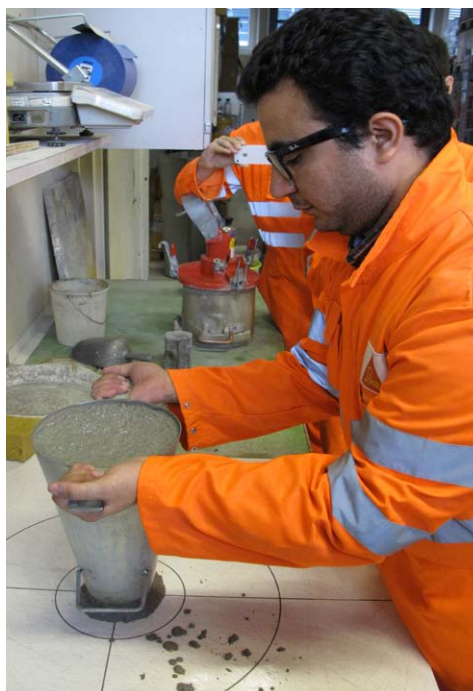
Preparing self-compacting concrete

“We are really glad to share our great experience abroad: the “Sika concrete experience”! We had the opportunity to immerse ourselves in Sika’s world of concrete, visiting jobsites, labs, plant facilities, workshops and much more. In Switzerland, during the internship, we had the chance to learn a lot about concrete mix design so that we were even able to design SCC (self-compacting concrete) recipes ourselves with special Sika software. Later, we were able to produce the concrete designed by us. The first try was hard. But after a number of attempts we were successful. It was just a fantastic experience. Other great moments were visiting the facilities, where we could see the process production