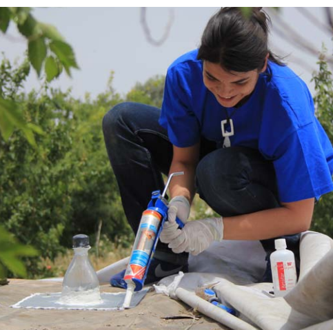
A volunteer using Sikaflex® AT-Connection

Sikaflex® is used to bond and seal the bottle to the roof. After installation this solar light bulb can provide approximately 55 watts of sunlight, capturing and diffracting it to all parts of the room. Without the water, there would be nothing more than a bright spot on the floor, surrounded by relative darkness. Sika is providing technical support for Liter of Light , along with know-how and product recommendations. In many countries where Liter of Light is being implemented, local Sika companies donate the necessary products such as Sikaflex® to the organization for free. The idea was launched in the Philippines in 2009, followed by countries like Mexico and Spain, with Colombia and Peru scheduled to participate this year. The aim of Liter of Light is also to facilitate the set-up of a global network to build a basis for international cooperation. This should increase awareness of the idea, simplify fundraising and make the sourcing of materials more cost-efficient.