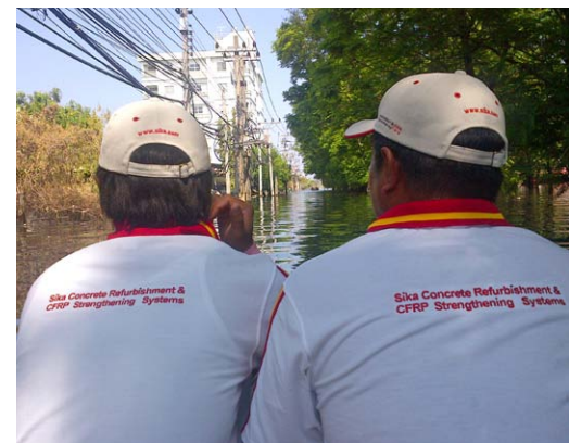
Employees checking the flooding status to propose adequate repair systems