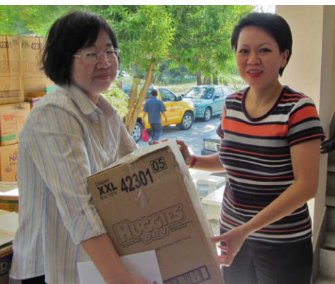
Employees preparing needed goods for children

Since December 2011, Thailand has been rebuilding its infrastructure and repairing houses and damaged factories. Sika has held more than 15 seminars on repair systems and solutions for flood protection construction for affected stakeholders. The main product areas are Concrete Repair, Industrial Flooring and Waterproofing.