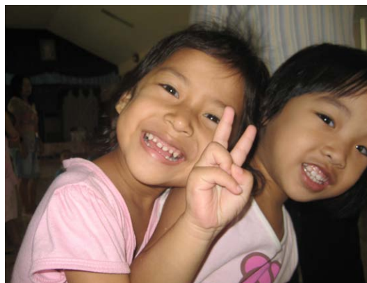
Homeless children receiving needed goods from Sika after the flooding