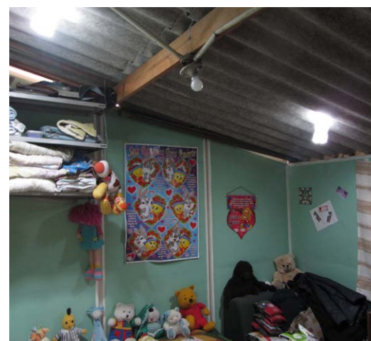
One room enlightened by two bottles