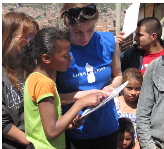
Teaching children how to use the bottles