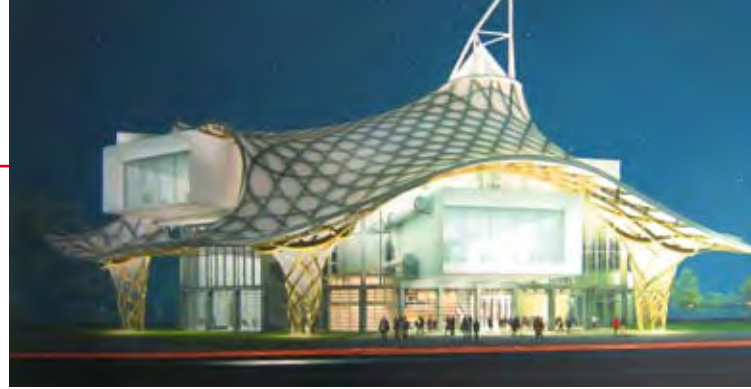
The Center Pompidou was designed by the architects Shigeru Ban Architects Europe with Jean de Gastines and Philip Gumuchjan

The center offers space to three galleries which run through the building, offering in total 3460 m 2 of exhibition space. The galleries consist of rectangular boxes that project through the building at different levels,