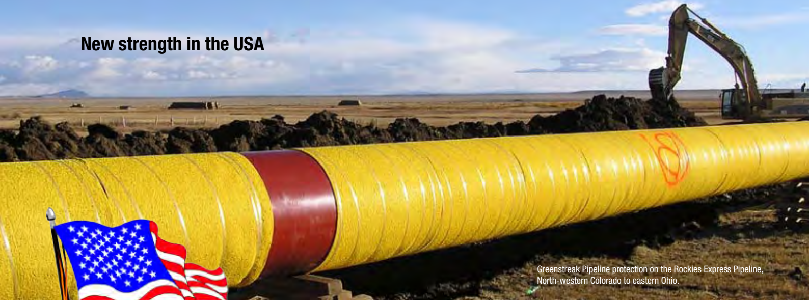
Greenstreak Pipeline protection on the Rockies Express Pipeline, North-western Colorado to eastern Ohio.

In the year 2010, Sika acquired two companies in the USA to further expand its leading position in the North American construction industry.