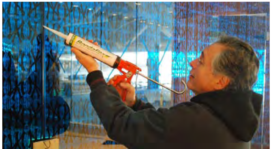
May National Associates Inc. provides the Bondaflex polyurethane sealant for the renovation of the Empire State Building.

The further acquisition of May National Associates, Inc., a leading manufacturer of silicone and polyurethane products with annual sales revenue of approximately USD 20 million, enables Sika to build up its silicone sealants offering – especially in the growing solar and façade markets in North America. Sika can now build a strong silicone footprint in North America and expand its global silicone technology and know-how to this important region.