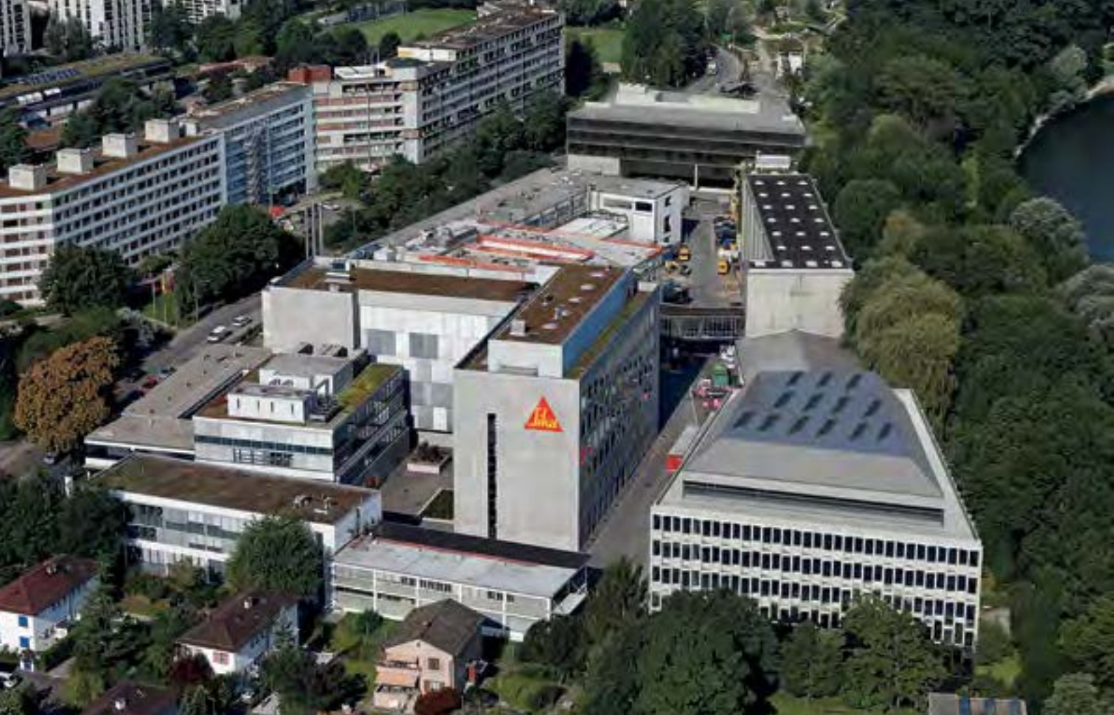
The new "Limmat" building will be a state-of-the-art laboratory and office building with capacity for a total of 300 employees.

> At a ceremony held end of June at its location in Zurich-Altstetten, Sika launched construction work on a further building on its existing site. The new "Limmat" building will be a state-of-the-art laboratory and office building with capacity for a total of 300 employees. Work is scheduled for completion by fall 2016. Sika plans to bring together 200 existing employees from other Sika branches in Zurich-Altstetten as well as create new jobs. This means that some 830 people will be working at Sika in Zurich by 2016. Within the company, the branch holds a leading position in research and development as well as the production of adhesives and sealants for automotive applications. Furthermore, Zurich is also home to key corporate functions and the marketing organization. Sika is one of the largest remaining industrial employers with production activities in Zurich.