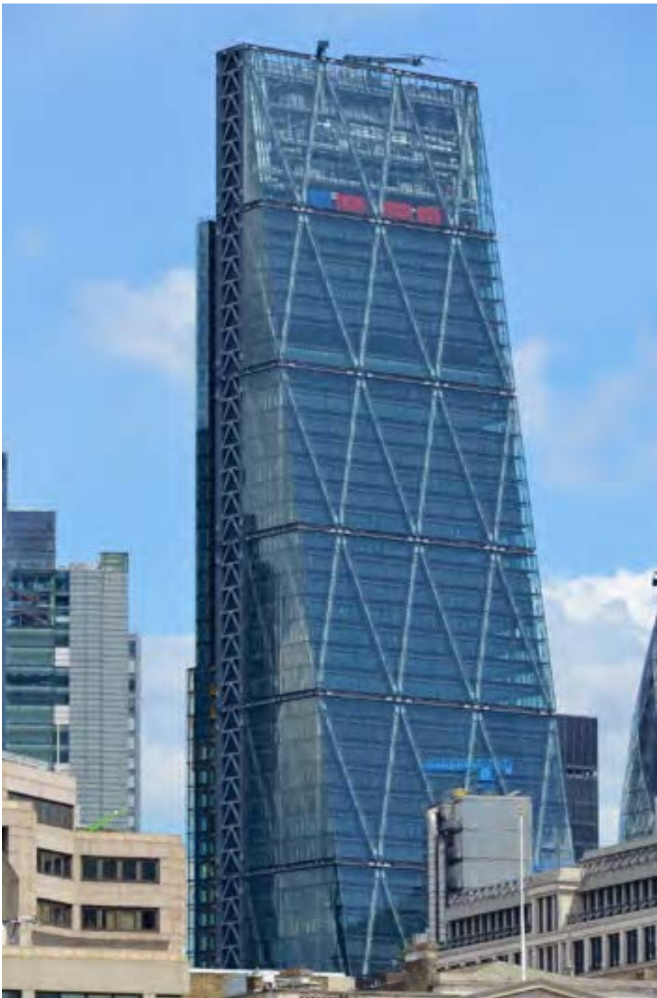
Designed by Richard Rogers and developed by British Land and Oxford Properties, the new Leadenhall Building will be 225 m tall, with 48 floors