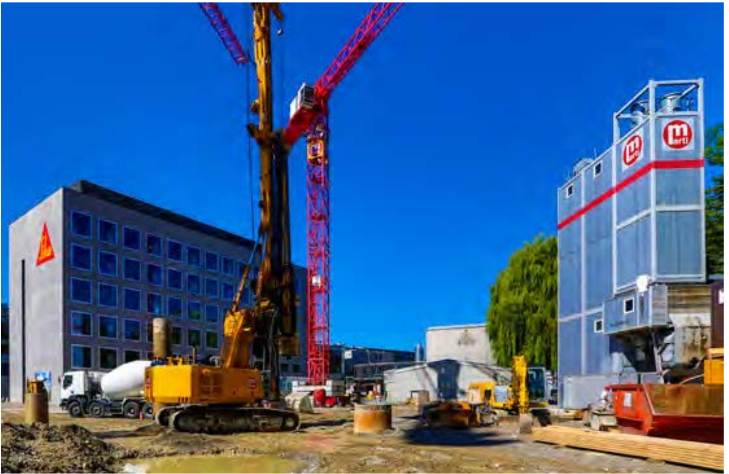
The new building in progress.

hesives for the automotive industry and sealants for construction applications.