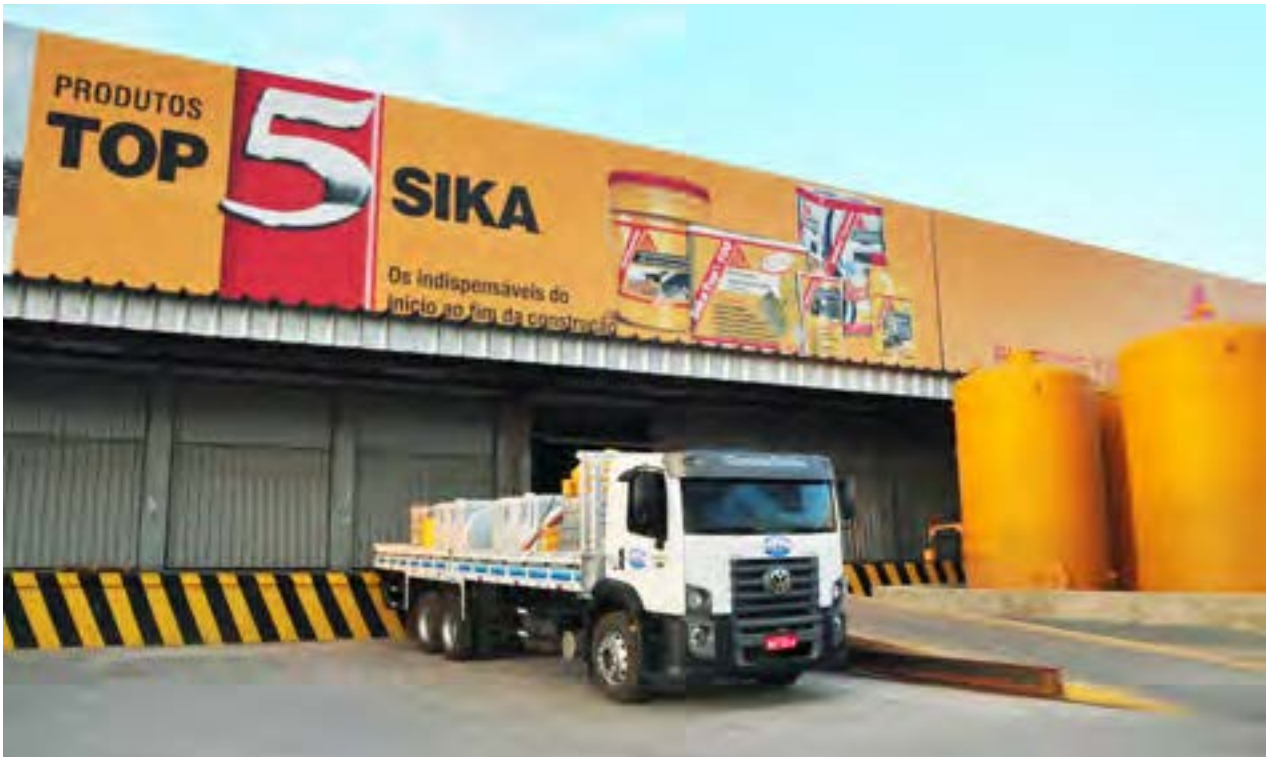
The new plant in Aparecida de Goiânia meets the needs of customers in the mid-west of Brazil.