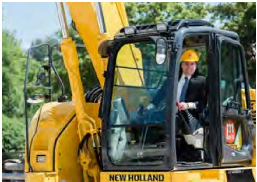
Sika CEO Jan Jenisch launches work on Sika's CHF 60 million new-build project at the company's Zurich site.

The site also has production facilities with 200 employees working in three-shift cycles to manufacture adhesives that are destined primarily for the automotive industry and are crucial to trends in automobile construction, such as light-weight assemblies, a reduction in weight and energy consumption, lower CO 2 emissions and increased safety. One in every four windshields produced worldwide is bonded using Sika products, as are four of the five car bodies voted the most innovative in 2013, i.e. the Mercedes S-Class, the BMW i3, the Lexus IS and the Range Rover Sport (source: Automotive Circle International, EuroCar Body Awards 2013).