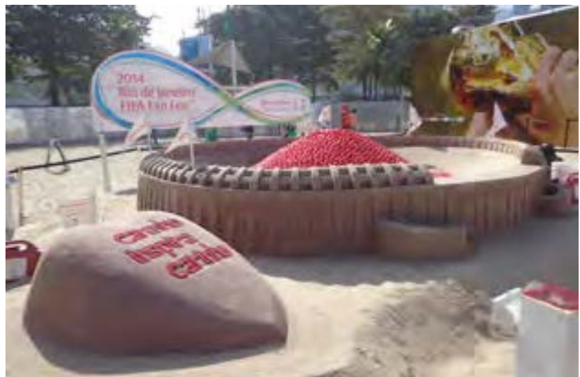
Even the famous Maracaña stadium the artist created out of sand.

The artist created several Football-related sculptures on different parts of the beach. One depicted Football mascot Fuleco, another the Cup itself. There were also players from different teams and the huge Maracanã stadium, which he built in a space set aside for crowds to watch the matches. The Maracanã will stay in place for a while longer so that people who were not in Brazil during the Event can take pictures. The sculptures take 5 to 15 days to create and last for up three months.